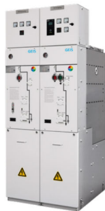
RMU Gas Insulated Switchgear