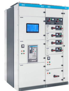
MLS LV Switchgear