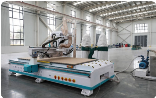
CNC Panel Cutter