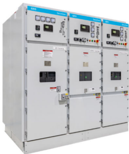
SecoGear MV Switchgear