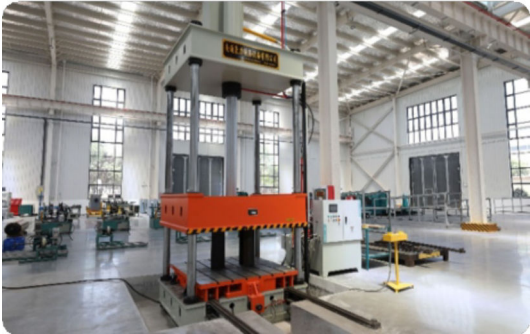
Four-Column Hydraulic Press