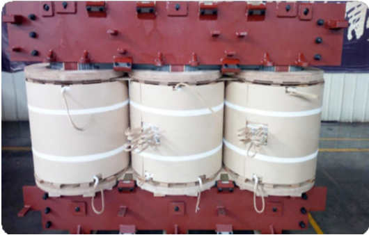
Main active part