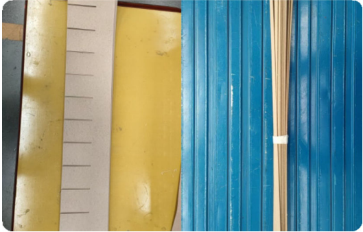
Corner ring and insulation paperboard