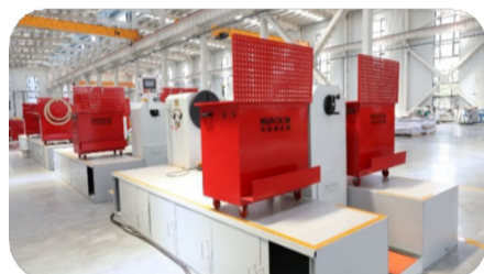
5T horizontal winding machines