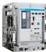
M-PACT Plus ACB