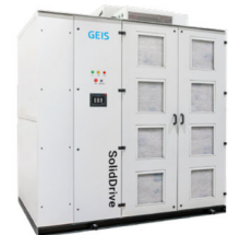
SolidDrive MV VFD