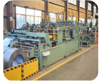
Automatic corrugated sheet forming and welding