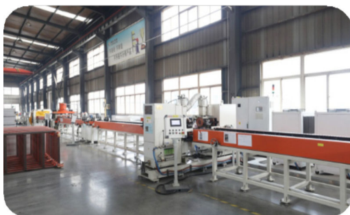
Raditor production line