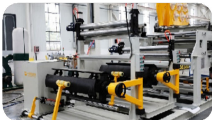
Intelligent foil winding machine

The HV winding of transformer is made of high strength enameled wire or paper-insulated wire, the LV winding is made of high strength enameled wire or paper-insulated wire and copper belt winding, which offers uniform distribution of ampere-turns, reasonable insulation structure so as to offer high ability to withstand short-circuit.