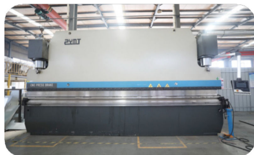
CNC bending machine